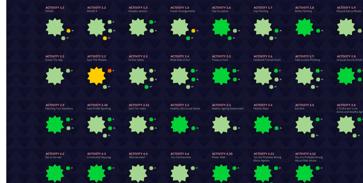
The pacing of the activity was appropriate.