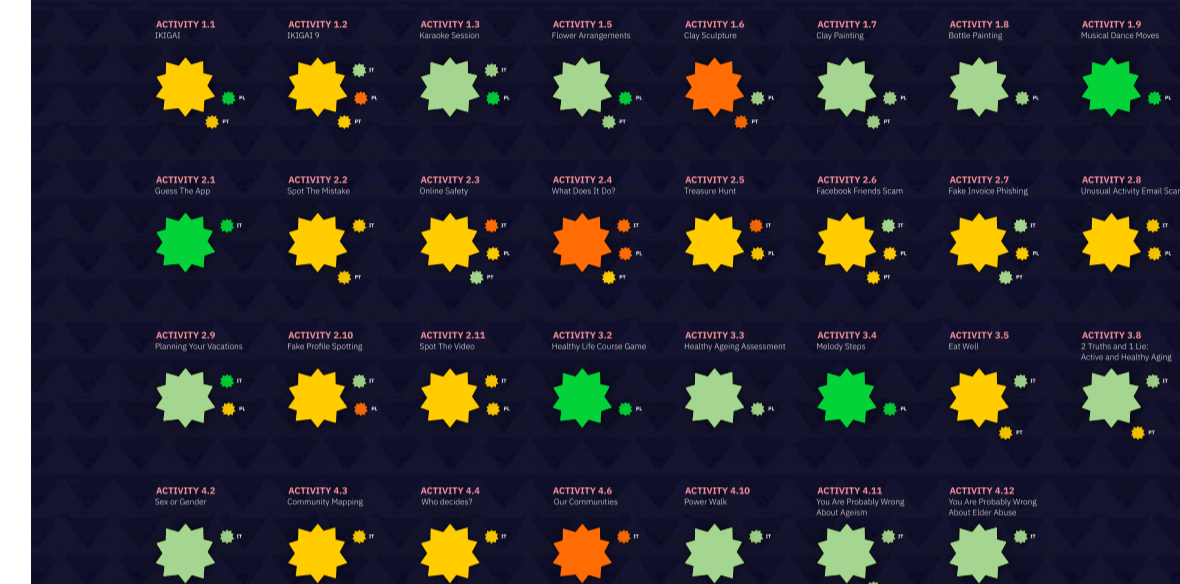
I needed help to complete this activity*