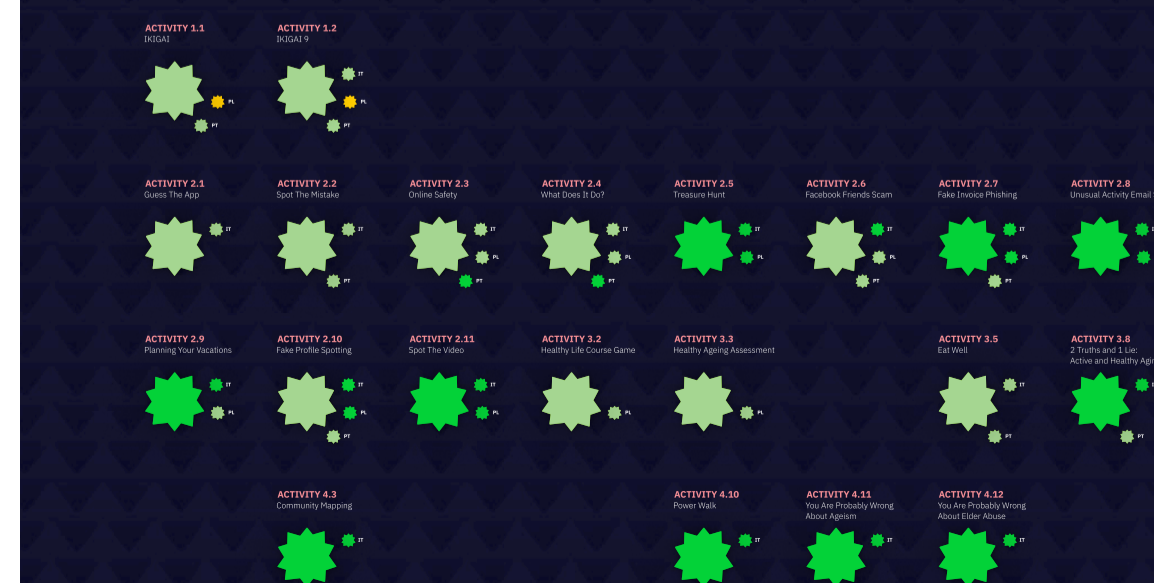
The size and readability of the text were adequate