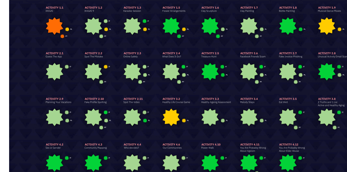
This activity offered something different from activities I have done before