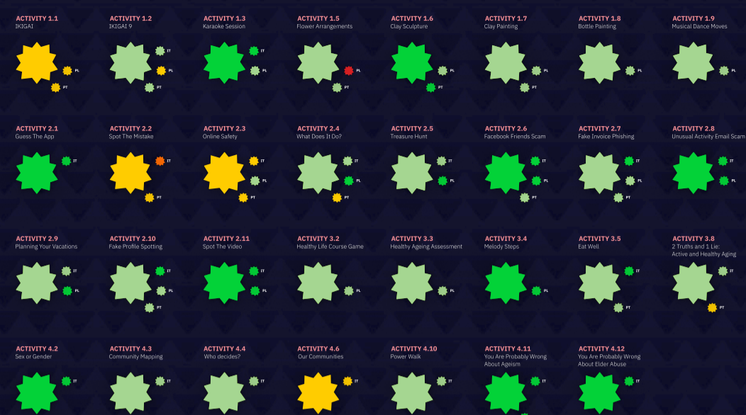
I had fun with this activity