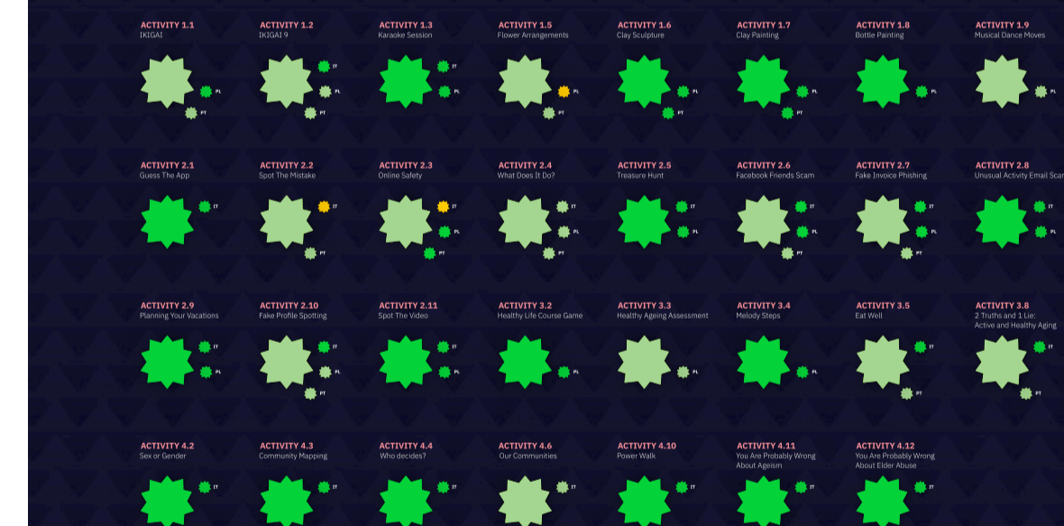
I felt safe and comfortable during the activity