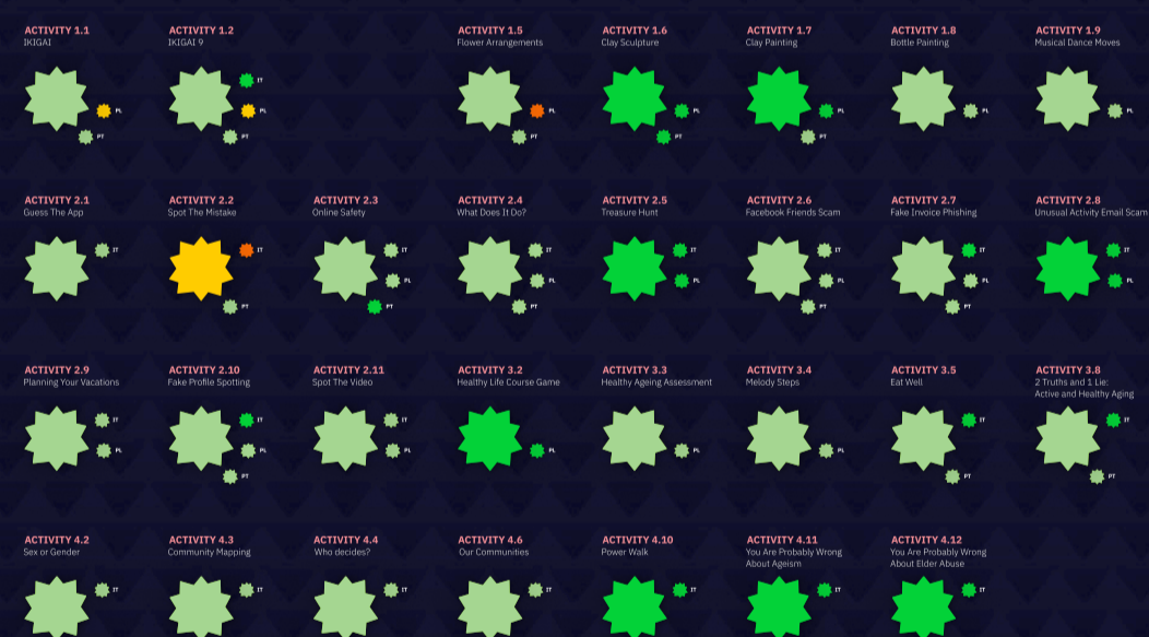
I liked the design and materials used in this activity