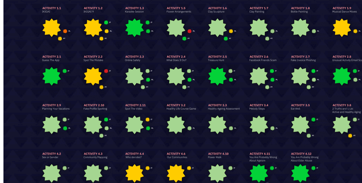
I would do this activity again