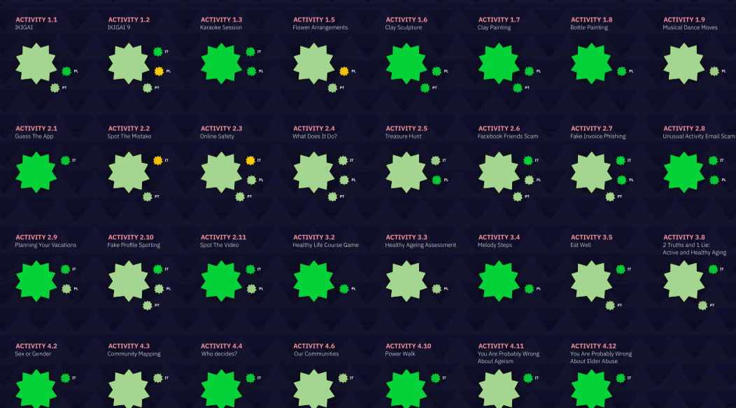
I was able to follow what I needed to do throughout the activity