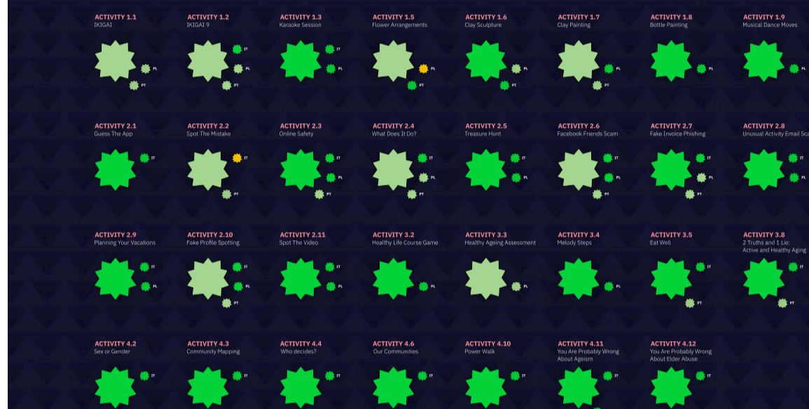
The facilitator provided helpful guidance.