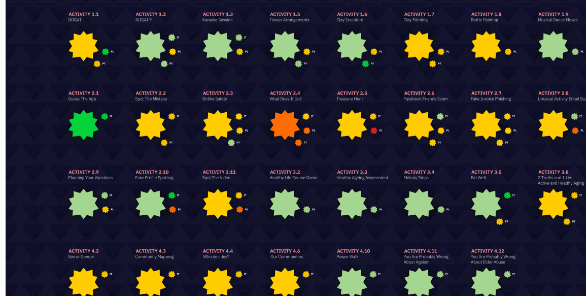
I struggled with this activity*