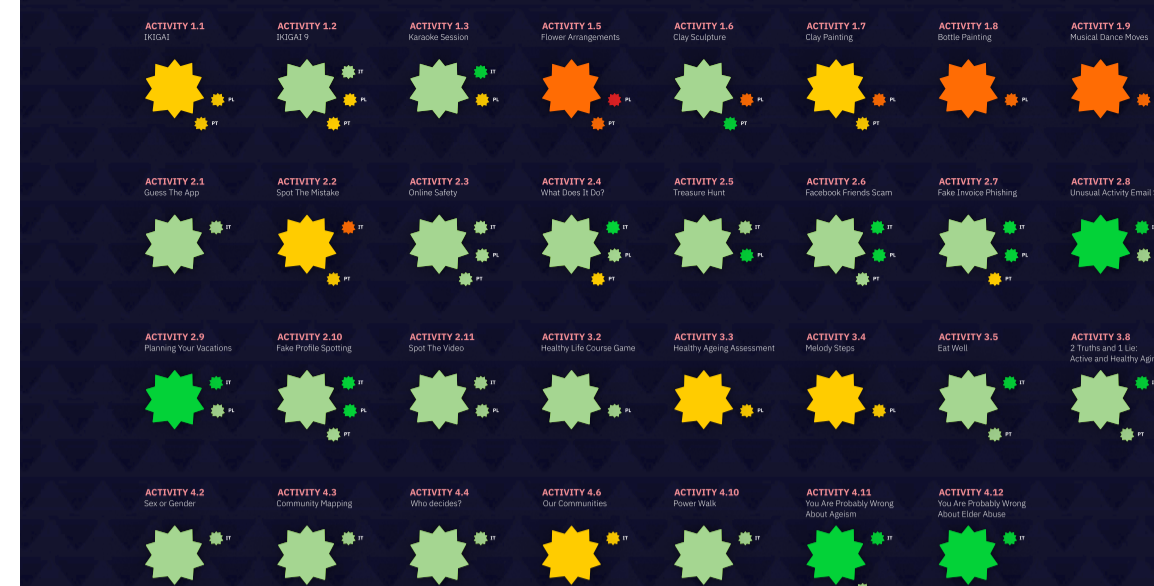
What I learned in this activity is useful in my daily life