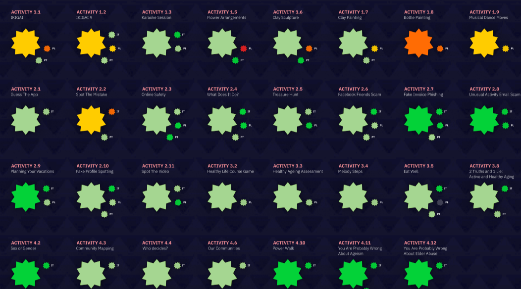
This activity maintained my interest