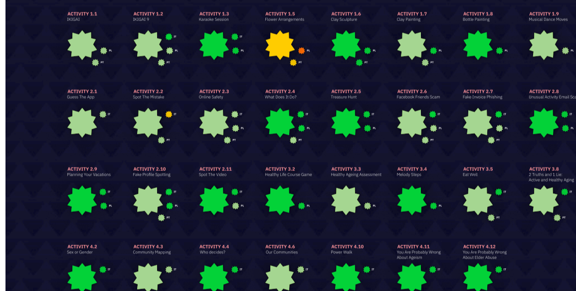
I participated actively during the activity